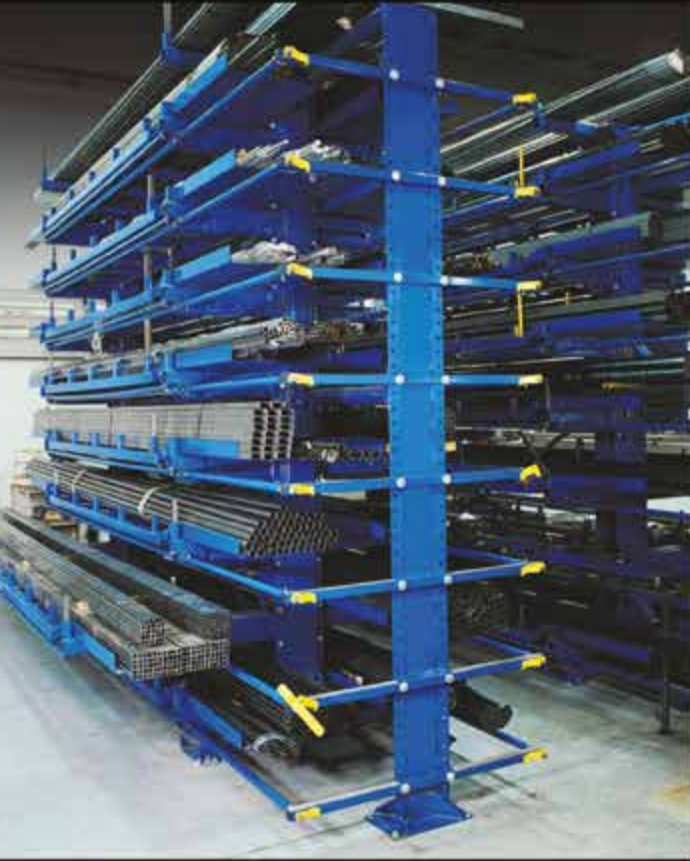
▲ Double-sided cantilever rack shown