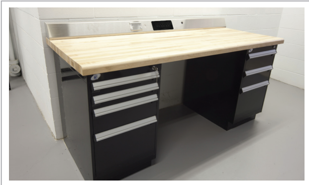
Lexus South Pointe (AB)

We have a solution for every need whether you are looking for a basic workbench with two legs and a top, or a specialized workbench, fixed or mobile.