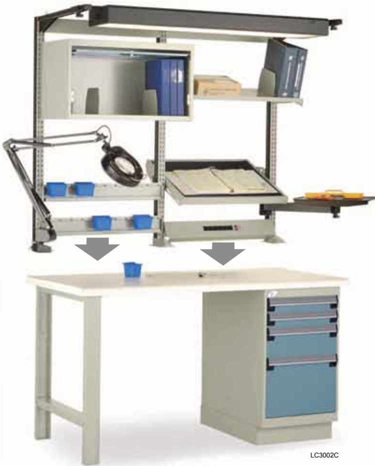
Rousseau product line

Visit us at www.rousseau-metal.com for all the details.